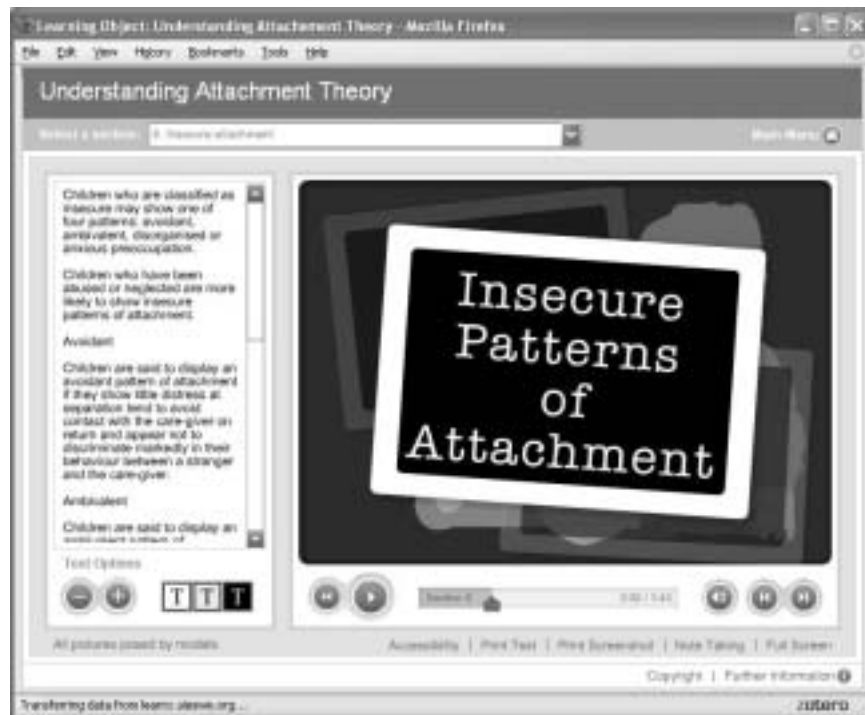
FIGURE 2. The Flash Template for the Multimedia Learning Objects

At the same time as developing the learning object repository, developing multimedia content, and repurposing other material, project staff